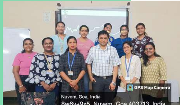
Nuvem, Goa, India 8w6v+9x5, Nuvem, Goa 403713, India