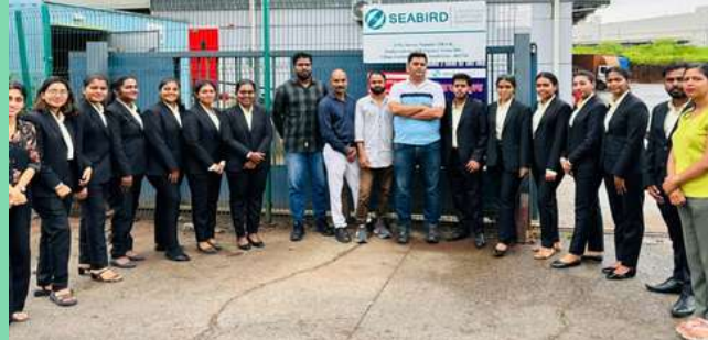
Visit to Seabird Logistics, Verna, Goa