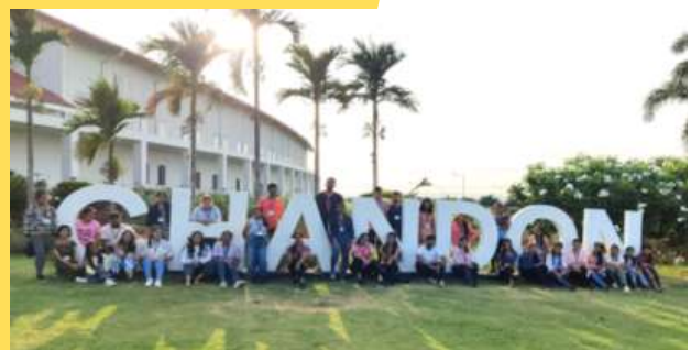
Experiential Learning at Chandon Winery, Nashik, 2022