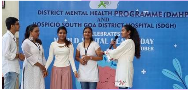
Celebration of World Mental Health Day at Hospicio Hospital