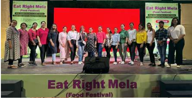
Eat Right Mela 2024