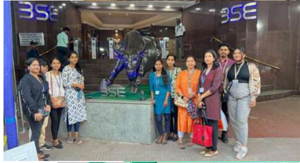
Visit to Bombay Stock Exchange