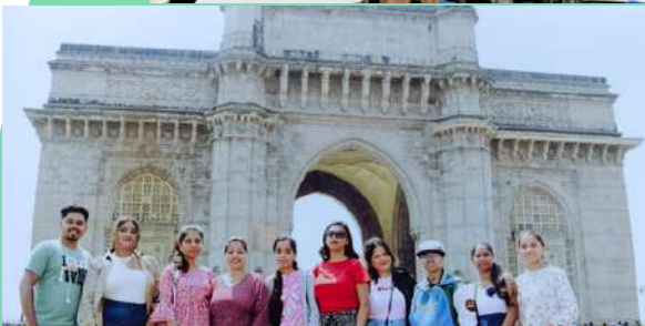
Annual College Tour