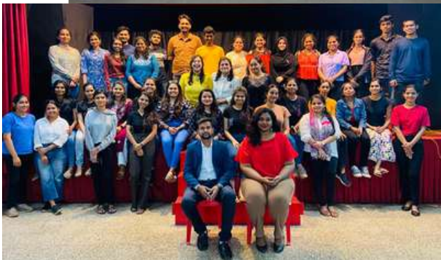
FSSAI-FoSTaC Training and Certification workshop