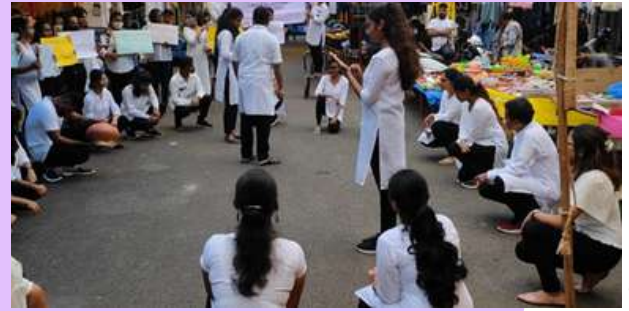
Street play Body shaming at Nuvem Market