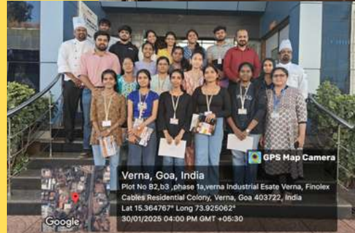
Visit/ Learning Activity at Kamaxi College and Fierce Kitchens Incubator under MoU