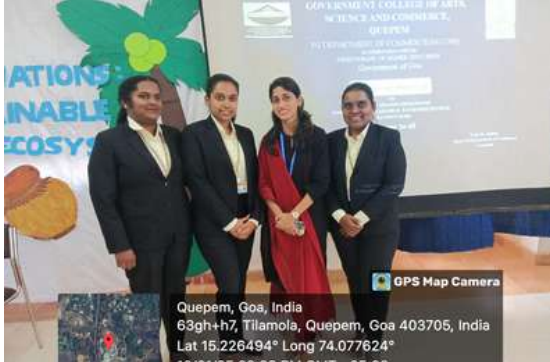
Quepem, Goa, India 63gh+h7, Tilamola, Quepem, Goa 403705, India Lat 15.226494° Long 74.077624°