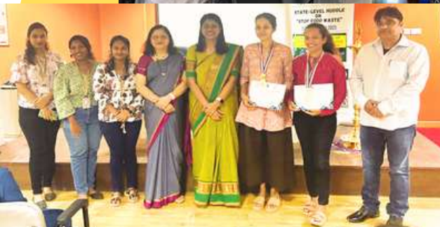
Winners of DFDA-GCHS Huddle