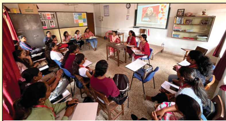
A discussion on current Economic issues

The Department of Economics' Research Forum stands not only as a testament to the commitment to academic excellence but also as a beacon inspiring the pursuit of knowledge, research, and critical thinking among its students and faculty.