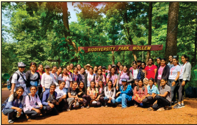
At the Biodiversity Park

The Department of Economics organized an educational tour to Rasraj Farm in Mollem -Goa on 14 th of October 2023 .The journey began by reporting at the respective railway stations and boarding trains headed to Kulem. From Kulem, we took a bus to reach Rasraj farms in Mollem. On the way, we had the opportunity to visit the Mollem Biodiversity Park, where we explored various spice