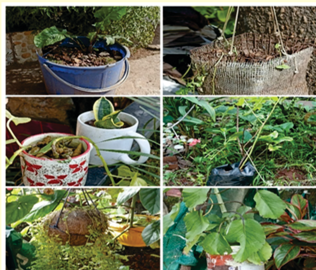
Garden of Sancia Gomes

Using discarded kitchen items such as broken handle mugs, broken pots, she has grown an impressive Teacup Garden. She also uses discarded tyres and coconut shells as planters, besides plastic containers and glass bottles.