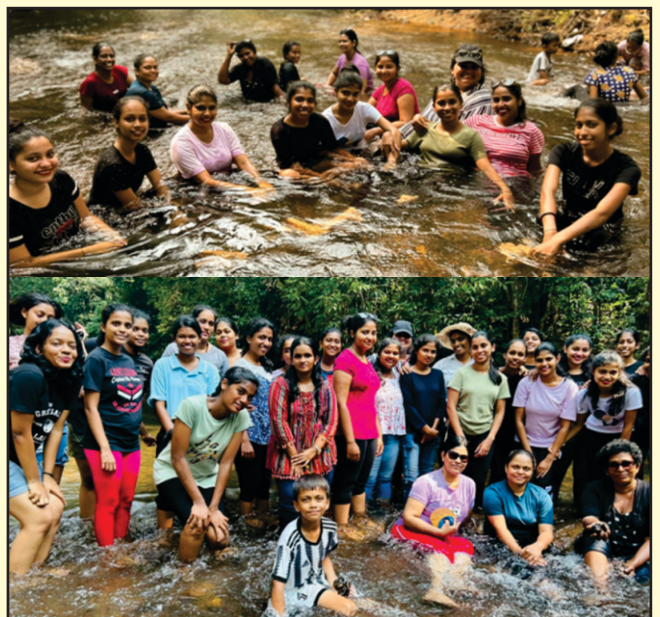
A dip in the cool waters of the Dudhsagar Stream

Continuing our exploration, we ventured into a fruit plantation. The vibrant colors and sweet aromas of the fruits were a feast for the senses. We learned about different types of fruits and their cultivation process. It was a refreshing experience to be surrounded by nature's bounty. As the day drew to a close, we bid farewell to the place and boarded the train. The train ride back was filled with laughter and reminiscing about the wonderful moments we had shared throughout the day. Each of us got off at our respective stations, carrying with us the memories of this fun and educational excursion. Overall, it was a captivating experience that combined learning and enjoyment. It was a day well-spent, leaving us with lasting memories and a desire for more adventures in the future.