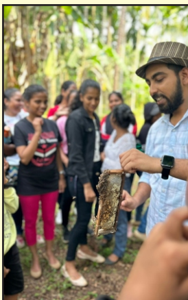
About Bees and Honey

plants and enjoyed a butterfly garden. Upon arrival at the farm, we were warmly welcomed by the owner. After being directed to the breakfast area, we were treated with a delicious meal and refreshing coolers. Following that, we embarked on a captivating tour of the arecanut plantation and the owner gave an insight about the arecanut production Our second stop was the bee hives, where we had the incredible opportunity to witness the production of honey and learn about honey