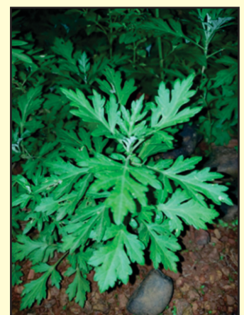
Artemisia vulgaris (mugwort or manpatri)

The leaves are used to treat many diseases like Asthma, inflammatory joint disease, inflammatory skin diseases, sciatic pain, coughs and colds, and infections