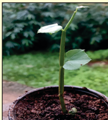
VELD GRAPE/ CISSUS QUADRANGULARISIT