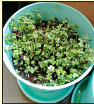
Mustard Seeds (Sasvam)