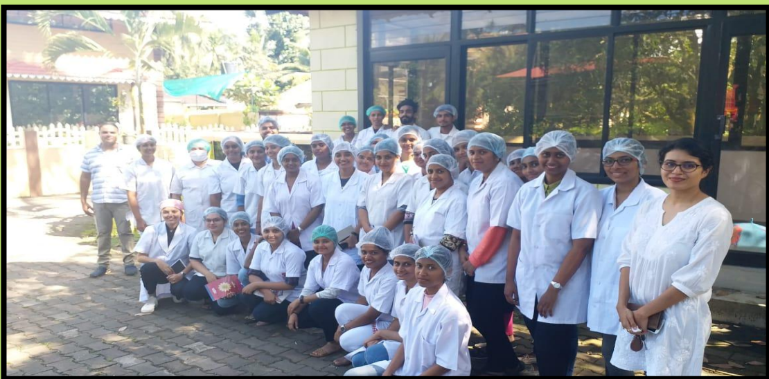
VISIT TO FESTA COLD MEAT MANUFACTURING UNIT, CUNCOLIM, GOA