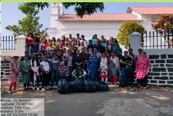
Latitude: 15.360427 Longitude: 73.901067 Elevation: 104.12m Accuracy: 3.2m Time: 01-15-2020 10:58

On 15 th January 2020, dept. of MA psychology, in collaboration with Msc. & M.com depts.. participated in Swacch Bharat cleanliness drive at Cansaulim. Students of MA part I, cleaned the area and collected many bags of garbage which included paper, glass & tetrapacks.