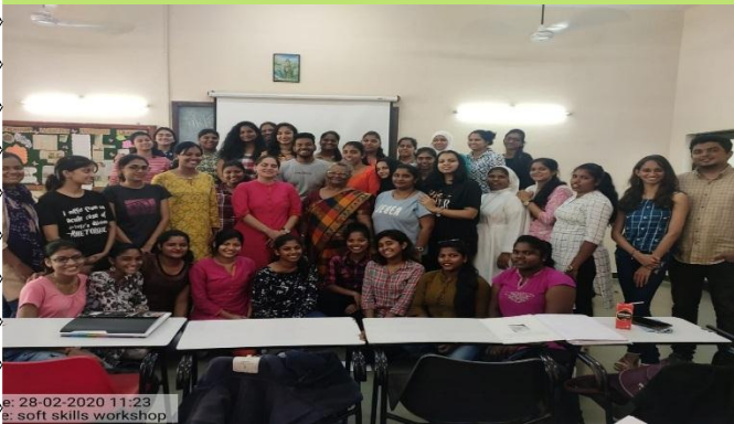
Latitude: 15.360427 Longitude: 73.901067 Elevation: 104.12m Accuracy: 3.2m Time: 28-02-2020 11:23 Event: soft skills workshop