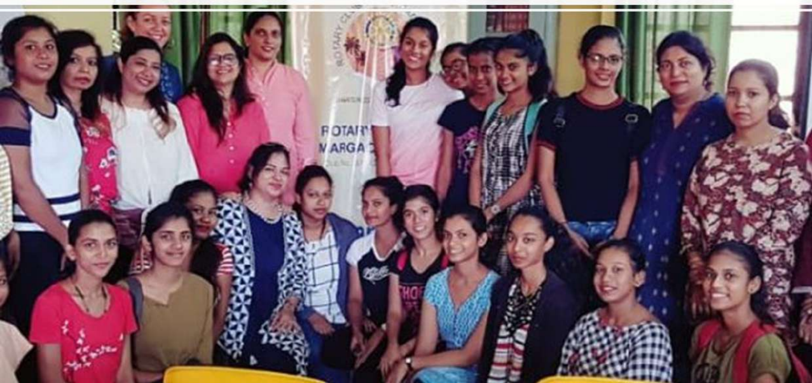
A Talk on Mental Health and Fitness held in the IQAC Room, Library Annex, Carmel College