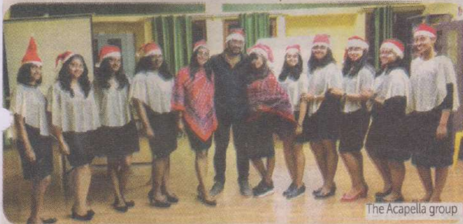
The Acapella group