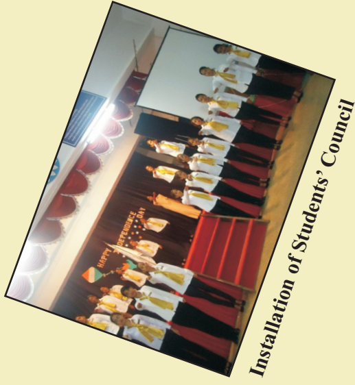
Installation of Students' Council