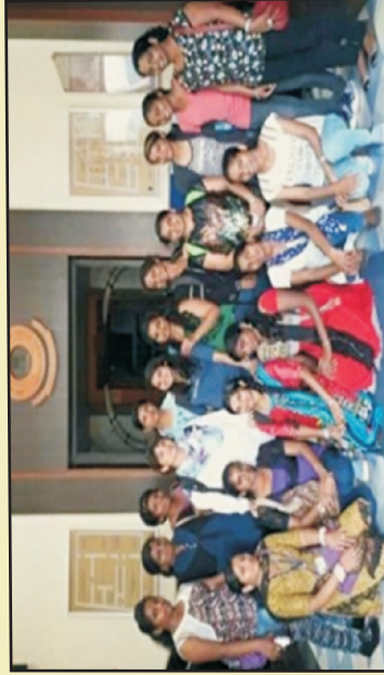
Visit to Custom's Museum