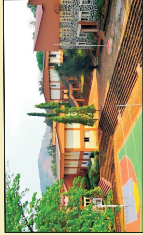
Layout of College