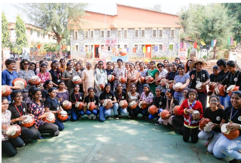
The first Women’s Ghumot club in Goa

A mélange of Goan culture was presented in ‘Muzganchem Fest’ an event organized in College that highlighted Goan music and traditional arts where over 700 girls participated in various dances, workshops and learnt from the many artistes who voluntarily shared their talents in clay sculpting, syringe painting, cartooning, singing, playing traditional games, and weaving palm fronds. 69 students played the ‘ghumot’ a traditional instrument that was banned earlier but now has gained new popularity, setting up a world record of sorts. Apart from this, there was a traditional mando performance, a tiatr, kotti dance, a Kunbi dance while a brass band also entertained the crowds.